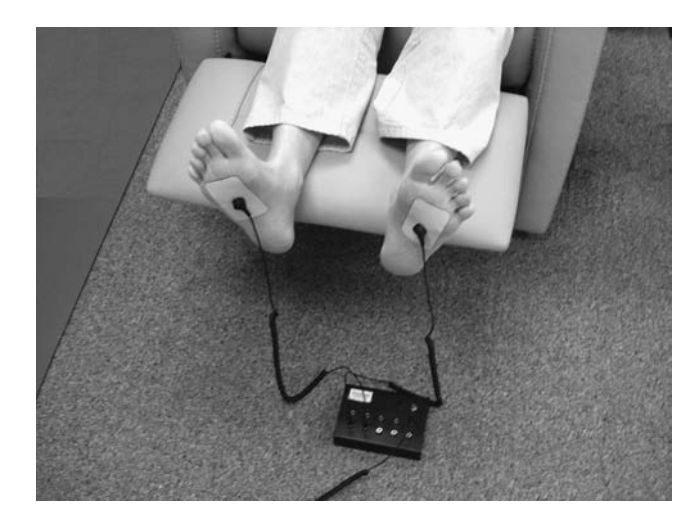
FIG. 1. Grounding system showing patches, wires, and box connecting to a ground rod planted outside through a switch (not shown) and a fuse (not shown). Similar patches and wires from the hands were also connected to the box to ground the hands.

attached to the electrode patches and connected to a box (Fig. 1). The grounding system itself consisted of a 100-footlong (30.48 m) ground cord connected to the box on one end and attached to a 12-inch (30.48 cm) stainless steel rod planted in the earth outdoors at the other end. Another box with a switch in between both ends of the grounding cord was used to cut or establish the connection with the earth. The switching box was placed in the control room. The ground cord contained an Underwriters Laboratories-approved 10-mA fuse.